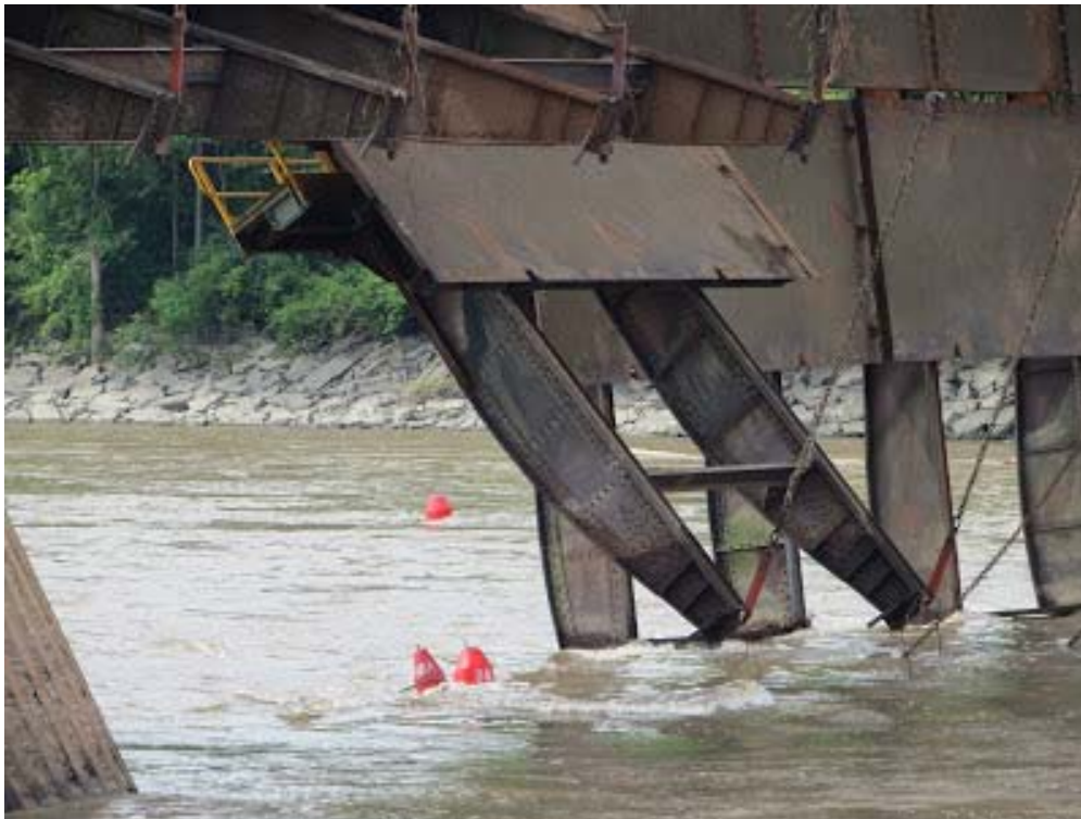
A view of the dam gates at Lock E-11 Photo courtesy of Wayne McManus "MY Help Me Rhonda"